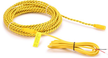
Fixed sense cable (connected before delivery)