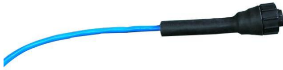
Split sense cable outgoing cable (purchase separately)