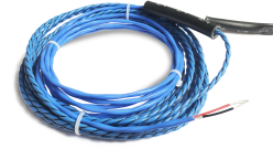
Fixed sense cable (connected before delivery)